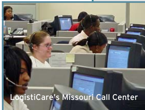
LogistiCare's Missouri Call Center

With LogistiCare, the state of Missouri and its tax payers will save $15 million over what the previous vendor was paid.